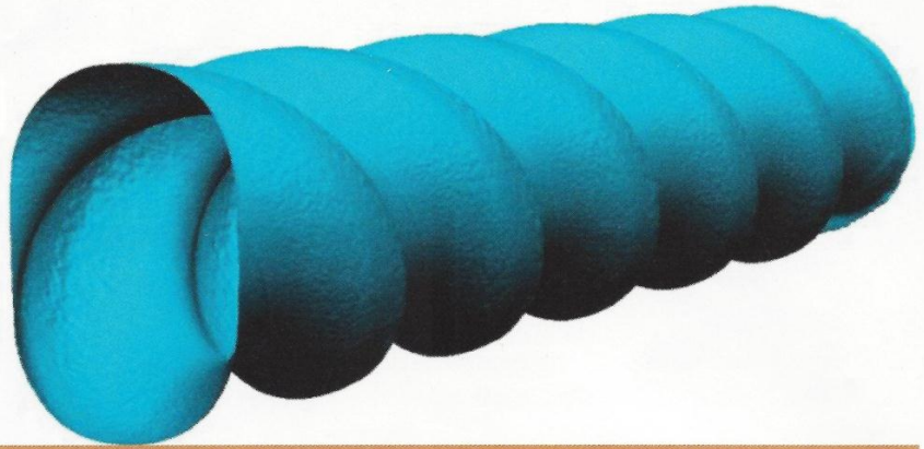
Figure 2. 3-D image of progressive cavity pump

Once fielded, PCP and PDM stators are subjected to a variety of harsh environments. The productivity, efficiency and life expectancy of a stator depend on how well it maintains its original shape and ductility. Failure modes—such as abrasive wear, chemical swelling and explosive decompression—result in deformation of the stator's internal geometry. All these factors can reduce efficiency and, in the worst case, lead to catastrophic failure. Using laser-based technology for the periodic inspection of stators may help operators avoid these failures, which can halt drilling activities, incurring costs and downtime.