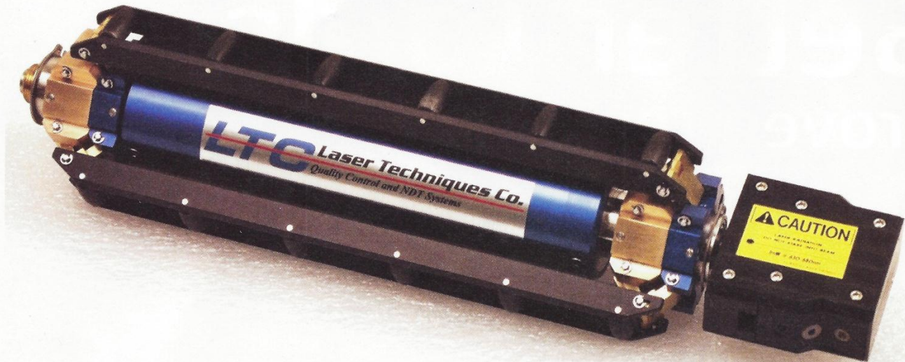
Laser-based sensors can be used to measure PCP and PDM stators.

inspection technologies such as laser-based bore mapping. The payoff is improved product quality, better performance and efficiency, and reduced product liability.